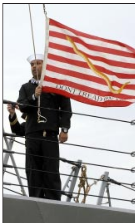
NORFOLK A Sailor aboard the guided-missile destroyer USS Ramage (DDG 61) prepares to shift colors as the ship pulls into port after a seven-month deployment. Ramage deployed as a part of the Iwo Jima Amphibious Ready Group supporting maritime security operations and theater security cooperation efforts in the U.S. 5th and 6th Fleet areas of responsibility.